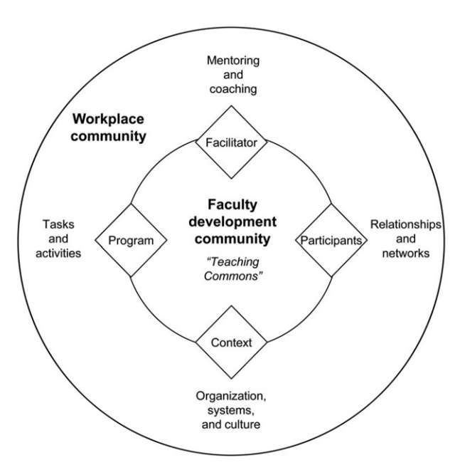
Figure 2. Expanded model of faculty development. This model for faculty development research suggests that faculty development is embedded in two communities of practice (the faculty development community and the workplace community). Reprinted with permission from O'Sullivan PS, Irby DM. 2011. Reframing research on faculty development. Acad Med. 86:421–428.

development is organized (e.g. classroom or clinic). Each component is also associated with teaching in the workplace, as participants involved in faculty development collaborate with other teachers or staff members, have relationships and networks in the workplace, fulfill tasks and activities within the educational program, have mentors and coaches in the work setting, and work in an organizational context characterized by a culture that either supports or inhibits educational change (O'Sullivan & Irby 2011). In describing this model, the authors argued that faculty development research should focus on process and outcomes, including relationships within the program and the workplace.