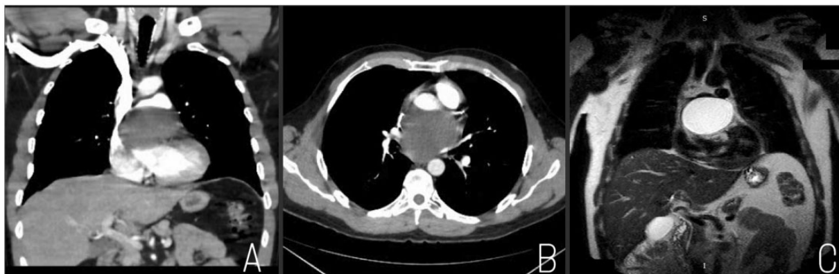
Figure 1. (A, B) Thoracic computed tomography angiography images. (C) Thoracic magnetic resonance image.